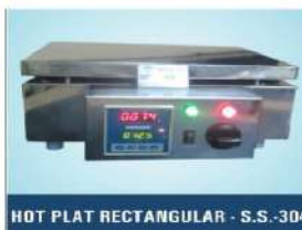
HOT PLAT RECTANGULAR - S.S.-304