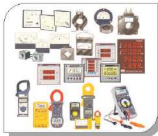
INST. IN HOUSE CALIBRATION & SUPPLY