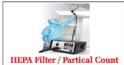
HEPA Filter / Partical Count