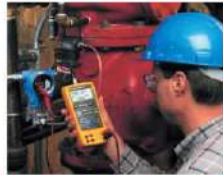
HVAC / Temp. Mapping/Air Audit