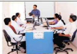
Training/Work Optimisation Consultancy