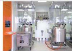
Autoclave / DHS / Steriliser