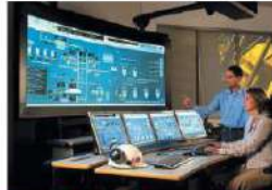
PLC / Scada / Software Validation