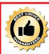
Best Choice Guaranteed