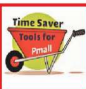
Time is Money