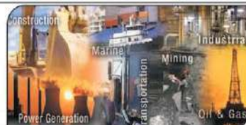
Safety / Energy / Environment Audit

For more detail : www.pmall.co.in , www.eindustries.in